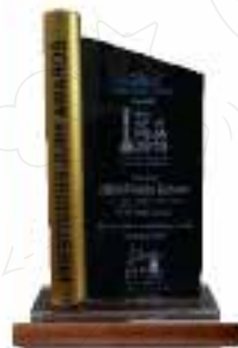
JURY Awards India's Top 50 PSJA, 2019 Tech-School of the Year