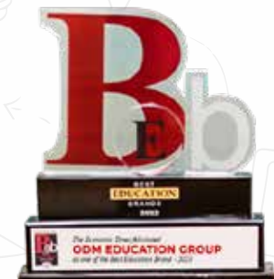
Best Education Brand Award by ET