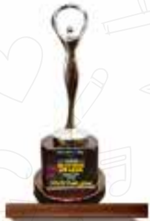
Times Business Awards Odisha 2022 Bhubaneswar Best School of Odisha (ODM Public School)