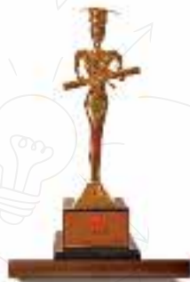
World Education Awards Delhi- 2019 Best use of ICT by the School Management