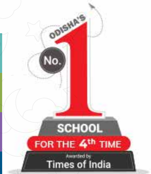
Times School Ranking Survey Odisha 2023