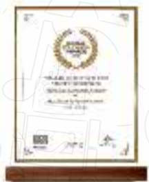
Global Education Awards Udaipur- 2019 Best use of Edtech in School